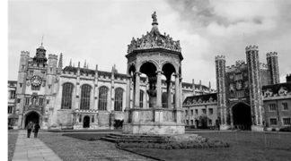
Taking part in a guided tour of Trinity College