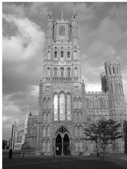
Visiting Ely Cathedral