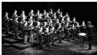
Going to a concert of the choir of King's College